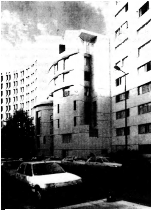
The world of the authoritarian commodity

The bourgeois republic can flatter itself that it was the first historical expression of any magnitude of this controlled ecstasy, and in the end the model for it. In it, in an unprecedented manner, the existence of man as a singular being finds itself formally separate from man's existence as a member of the community. Thus, in the bourgeois republic, where man is an acknowledged, veritable subject, he is abstracted from all qualities specific to him, and is a figure with no reality to it, a "citizen"; and where in his own eyes, as in the eyes of others, he passes for a real subject – in his everyday existence – he is a figure with no truth, an "individual." The classical era has in a way established the principles whose application has made man what we know him to be: the aggregation of a double nothingness: that of a "consumer," that untouchable , and that of a "citizen," that pathetic abstraction of impotence.