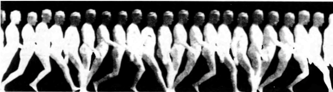
Ens Realissimum [the most real being]

Up to now, too much has been written, and not enough thought about Bloom.