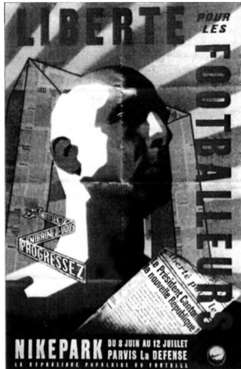
The world of the authoritarian commodity

Although Bloom is the fundamental possibility that man never ceases to contain , the real possibility of possibility, and has for that reason been described, felt out, and practiced many times over the centuries – both by the Gnostics in the first centuries of our era and by the heretics of the end of the Middle Ages (the brethren of the Free Spirit, the kabbalists, or the Rhenan mystics), by Buddhists as much as by Coquillards [large bandit groups of 1450s France] – Bloom nevertheless only appears as the dominant figure within the historical process at the moment when metaphysics reaches its completion, that is, in the Spectacle.