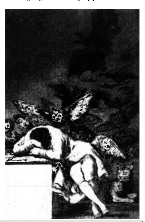
Goya, The Sleep of Reason Produces Monsters. "The spirit of nature is a hidden one, it does not manifest itself in the form of a spirit: it is only a spirit for minds that know it, and it is spirit in itself, but not for itself."

Remark: Bloom often attempts, with the use of apparently particular commodities, and with roles (in the sense of the term used by the Situationists) – roles that not only generally organize themselves around commodities, but are themselves commodities ontologically speaking, as the following section of this article makes clear – to capture a simulacrum of individuality. He sometimes attempts to take on a reassuring pseudobelonging to some puppetlike community or other, one of those that manage a poor