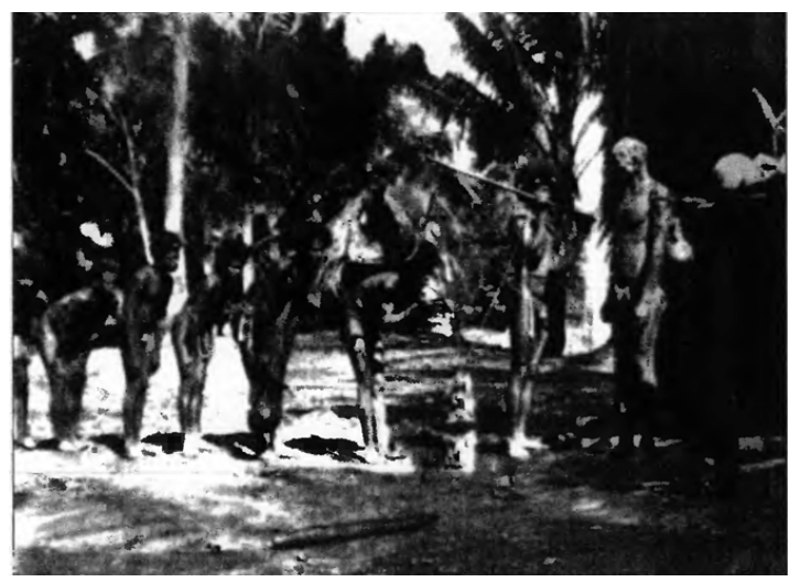
Adam Smith's homo economicus in its natural environment, engaged in financial speculation from the depths of the cave.

a farce all the more amusing considering that no such species has ever existed, even in the London-style "City," where nonetheless certain cave-dwelling sorcerers called "stock traders" abound.