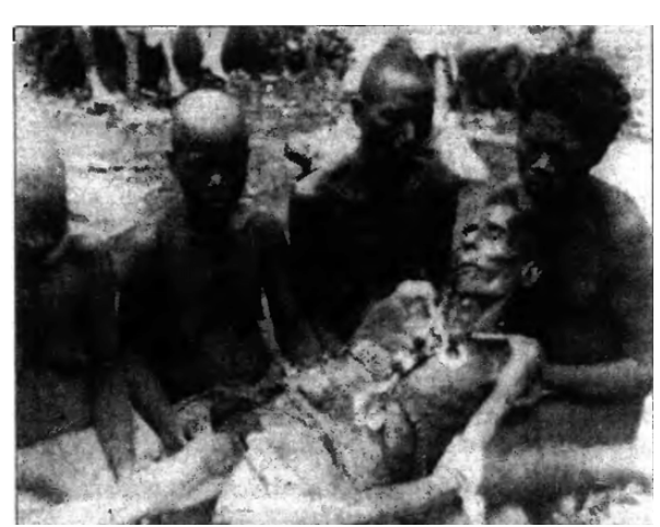
"The Common can however erupt into Publicity, in the form of individual or collective experiences, which are always experiences of the inexpressible. The presence of the Common is none other than the presence of the transcendent."

3) More specifically: the existence of this mystery can be rendered public,