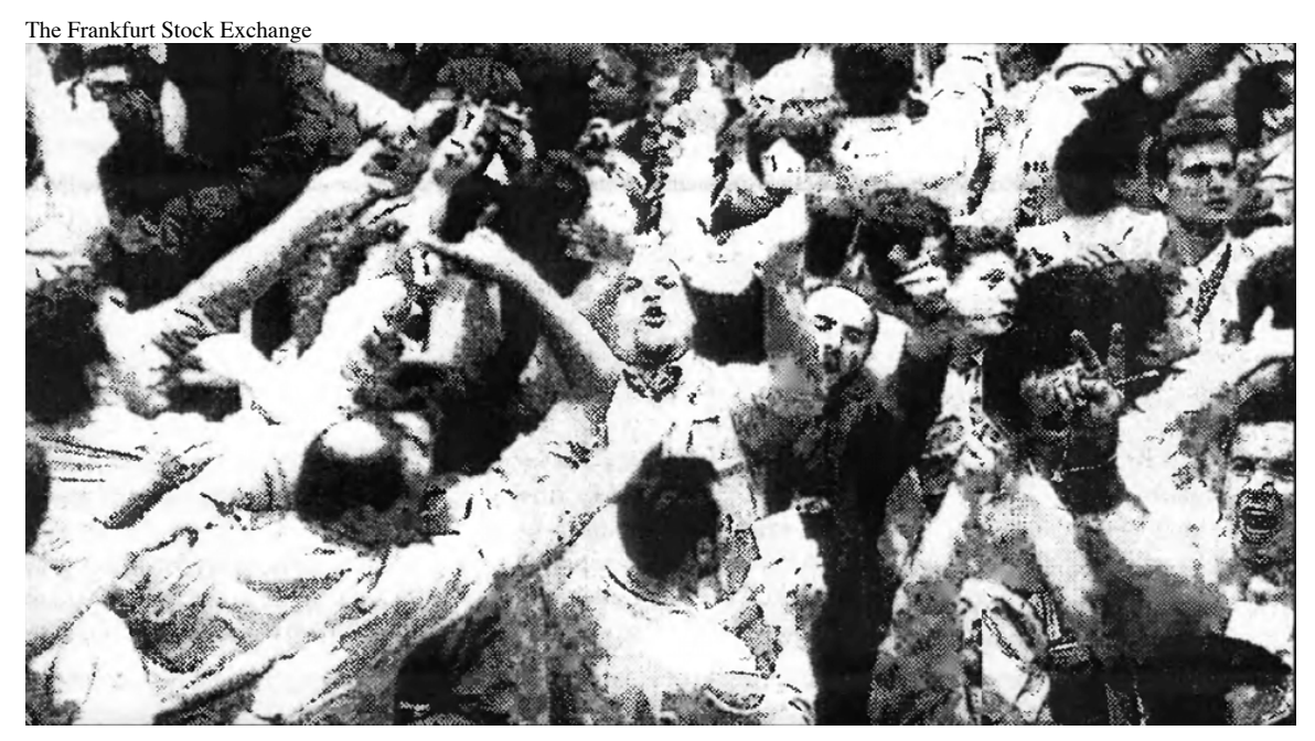
DOWN WITH BLACK MAGIC!